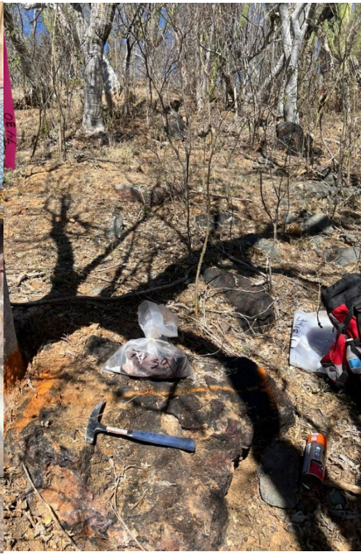
Plate 1. Photos from ongoing work program at Gran Pilar.