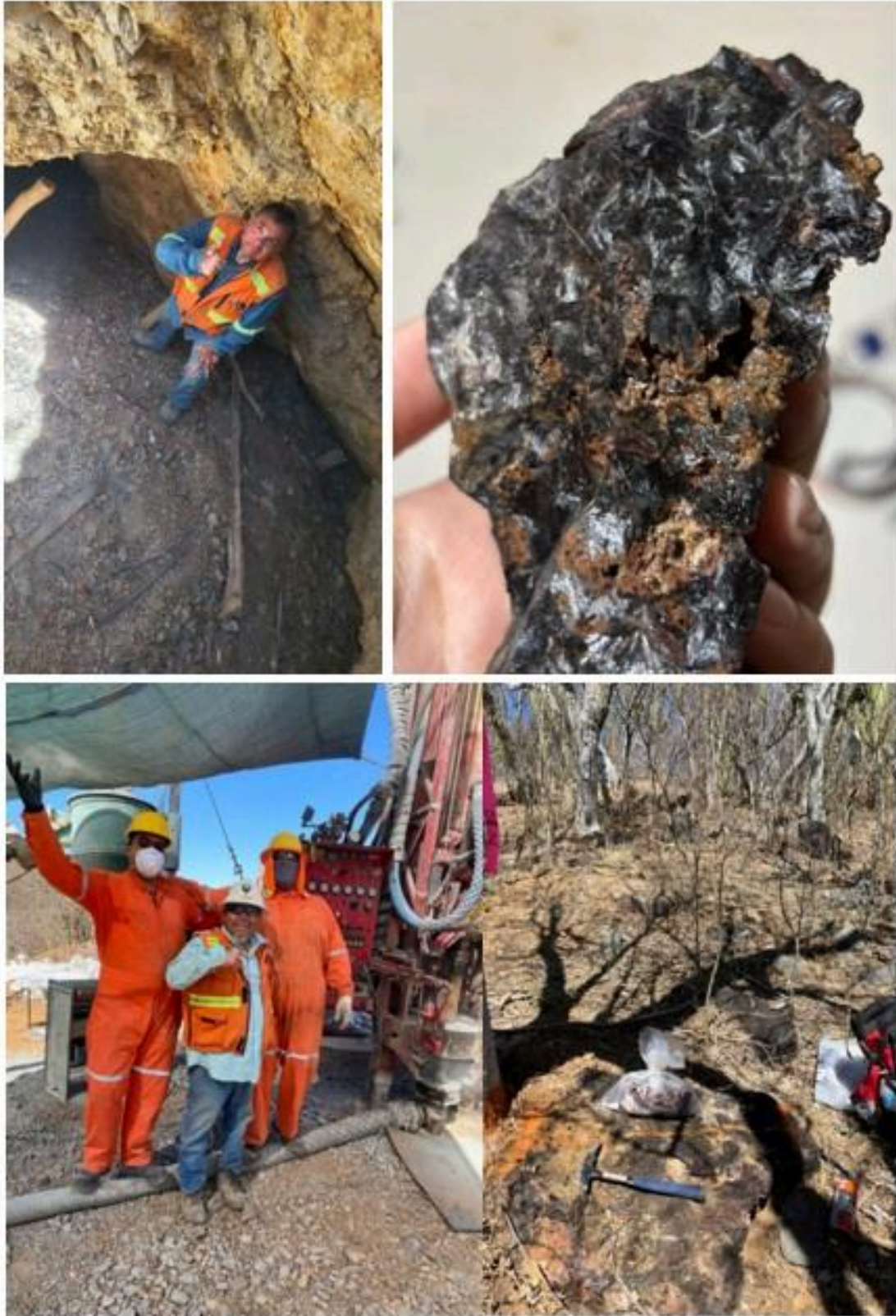
Plate 1. Photos from ongoing work program at Gran Pilar.