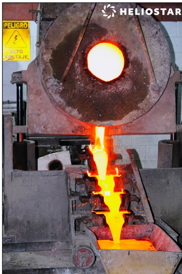
Photo 3: First gold pour from the restart of mining at San Agustin