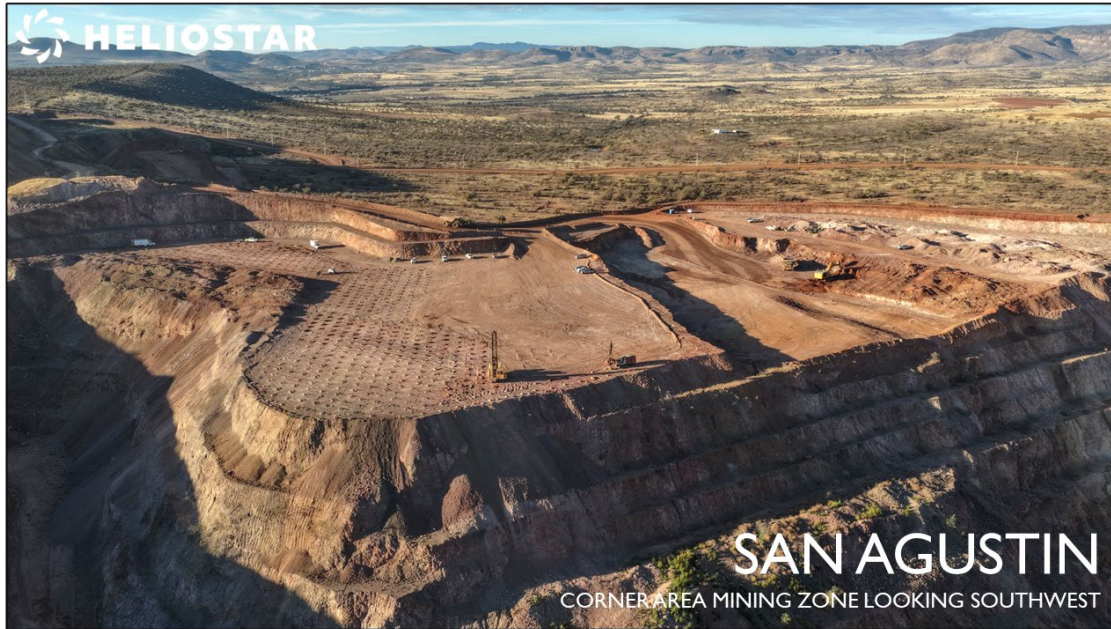
Photo 4: View of mining operations in the Corner Area at San Agustin