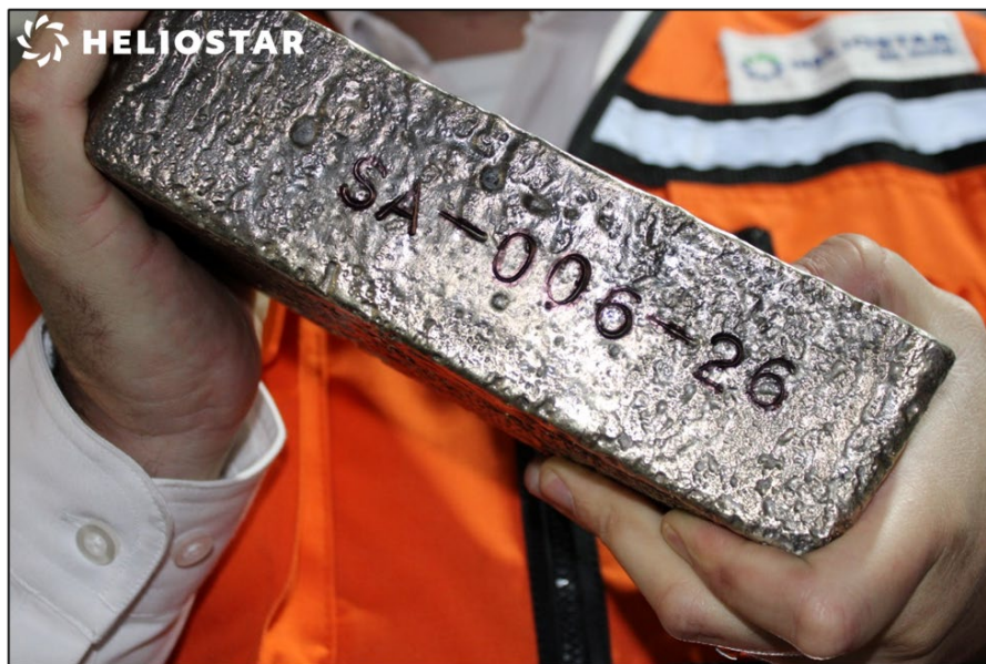
Photo 1: Dore bar from the first gold pour after the restart of mining at San Agustin

Charles Funk, CEO, comments: “It is an extraordinary time in the gold market to bring new production online. Bringing San Agustin online has increased our year-on-year consolidated production guidance by over 60% whilst maintaining a low ~$2,000 AISC in 2026. At our 2026 budget gold price of $3,800 per ounce, cash flow from San Agustin allows us to fund our company-wide exploration programs and capital programs, including a pit expansion at La Colorada and decline development at Ana Paula. At current spot prices, we can do all this and build our cash position more rapidly to help fund the Ana Paula CAPEX planned for 2027/28. At San Agustin, the next key update will be results from the drill program targeting mine life extension. These results are expected in mid-late Q1, 2026.”