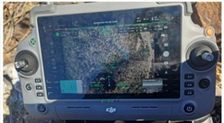
Plate 1: Photos of recent project work at Gran Pilar, Sonora Mexico