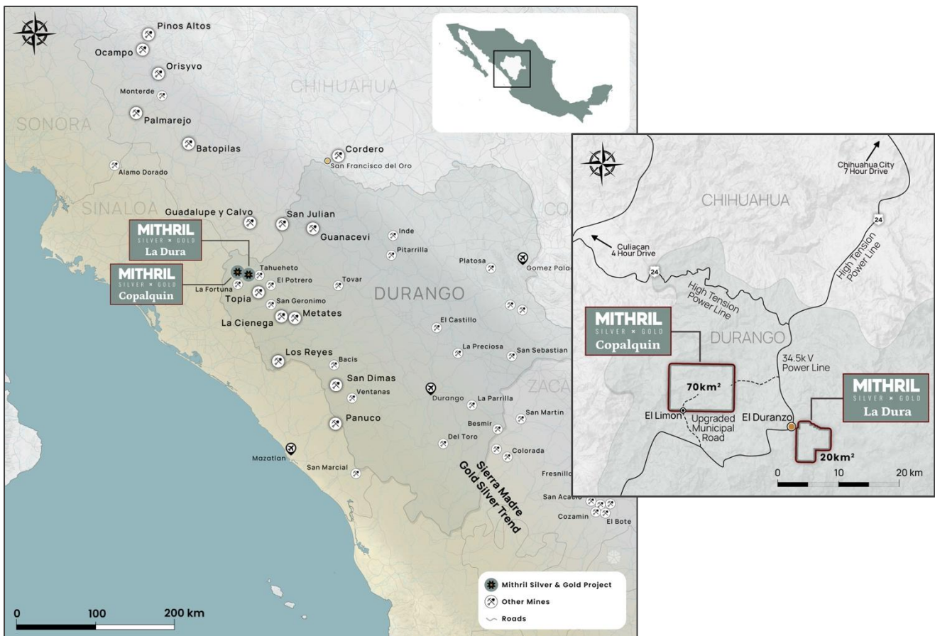
Figure 1 Mithril’s Copalquin and La Dura property locations in Durango State, Mexico

Mithril is advancing toward an aggressive exploration program in 2026, with 25,000 metres of drilling planned and up to three drills turning during the first half of the year across the Copalquin District. Upcoming work will focus on expanding known mineralized zones, testing new high-priority targets, integrating district-wide geophysical data, and continuing to advance the Company’s district-scale exploration thesis.