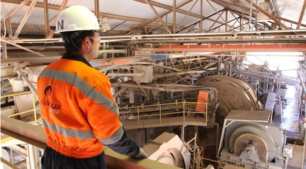
Figure 5: Bolanitos mill interior. The mill is currently operating at approximately 75% capacity; the Company expects to achieve increased capacity at Bolanitos through the addition of mineralized material from San Ignacio.

The mining method used at Bolanitos is primarily long-hole stoping and conventional cut and fill mining. Mineralized material is brought to surface for crushing and grinding. The 1,600 tonnes per day flotation processing facility produces a bulk gold-silver concentrate, and currently operates at approximately 75% capacity, allowing for processing of mined material from San Ignacio. Endeavour purchased the Bolanitos Mine from Penoles S.A. de C.V. in 2007 and has made incremental expansions and improvements since acquisition.