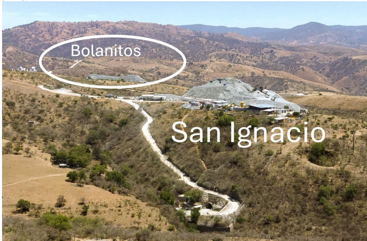
Figure 6: Proximity of the primary stockpiles at Bolanitos and San Ignacio. The Bolanitos mill is located within two kilometres of the San Ignacio project; the two properties are contiguous and share the same geology.