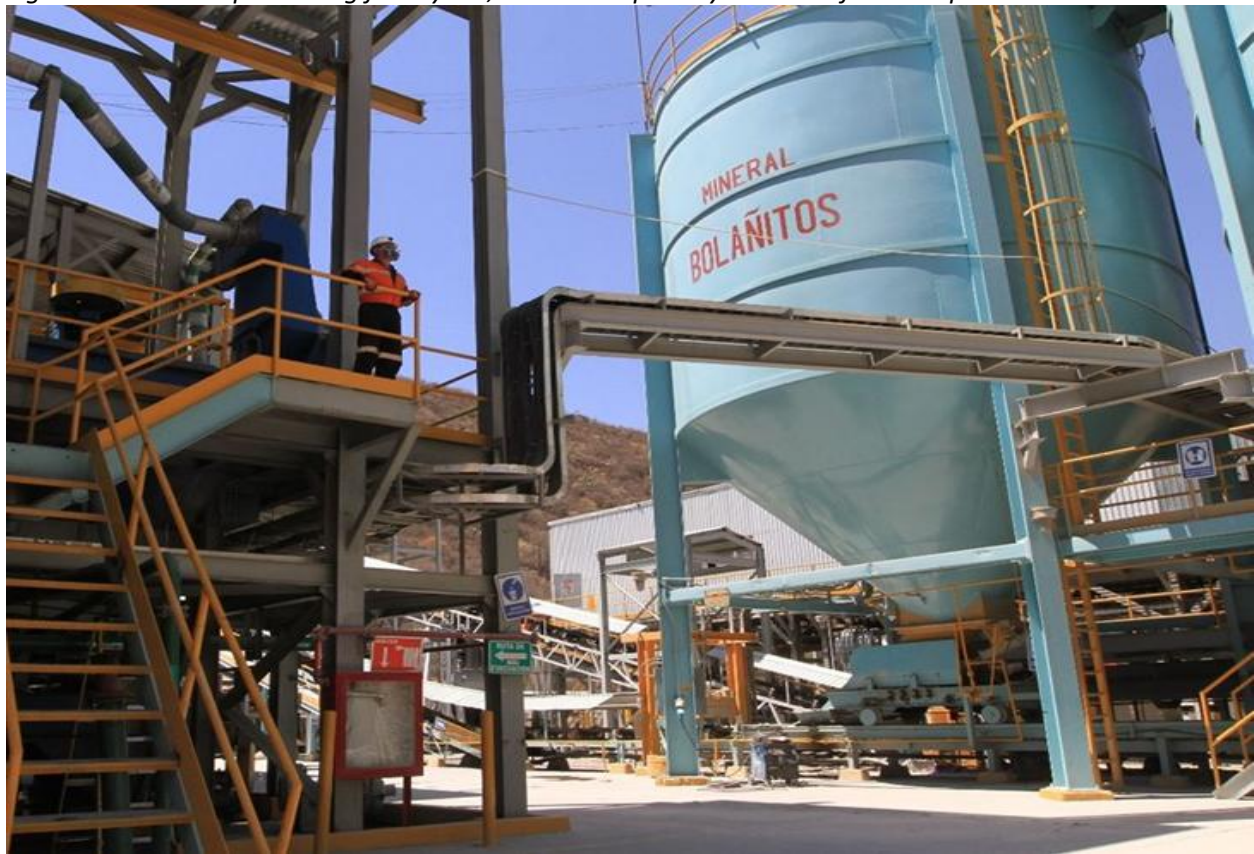
Figure 2: Bolanitos processing facility – 1,600 tonnes per day standard flotation plant.