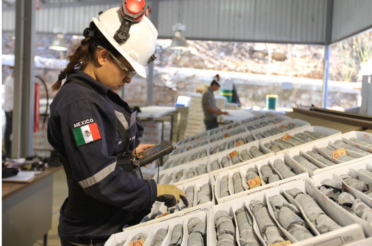
Figure 7: Bolanitos is a primary gold mine centered on the epithermal vein structures of the La Luz fault system.