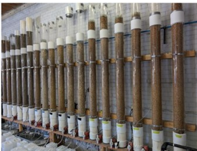
Figure 1: Large-diameter Metates PFS columns Figure 2: Metates variability columns

To view an enhanced version of this graphic, please visit: