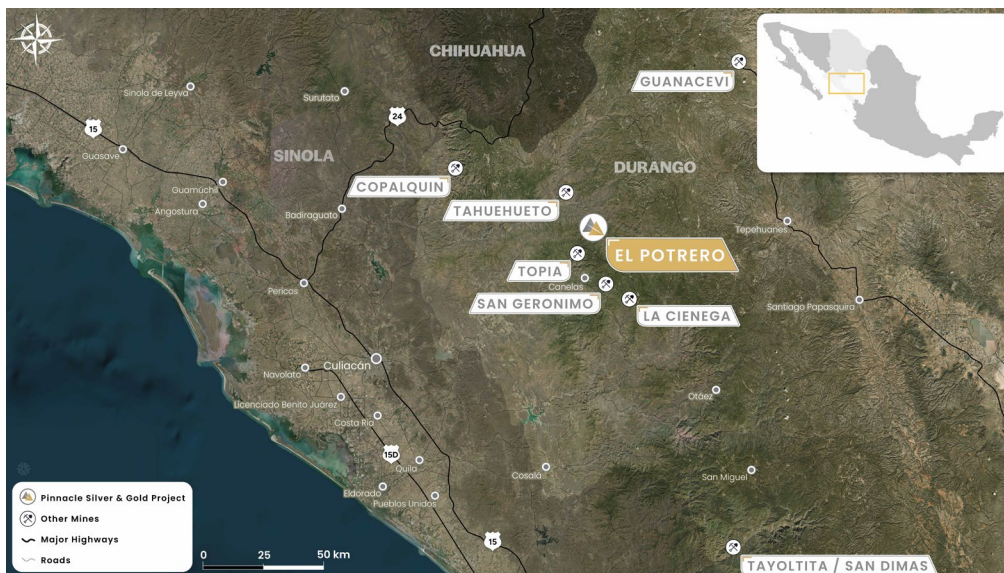
Figure 1: Regional location map of the Potrero Project, Durango, Mexico

Additional channel sampling is also being conducted in areas that were previously restricted by accessibility that has now been improved by the installation of metal ladders. First pass sampling of the Dos de Mayo mine is complete, with 167 samples taken and submitted to the SGS lab in Durango. Underground mapping and sampling will now progress to the easternmost La Dura and La Dura 2 workings, where fine-grained visible gold and ginguero (grey-black bands of electrum and silver sulphides) were observed on the site visit.