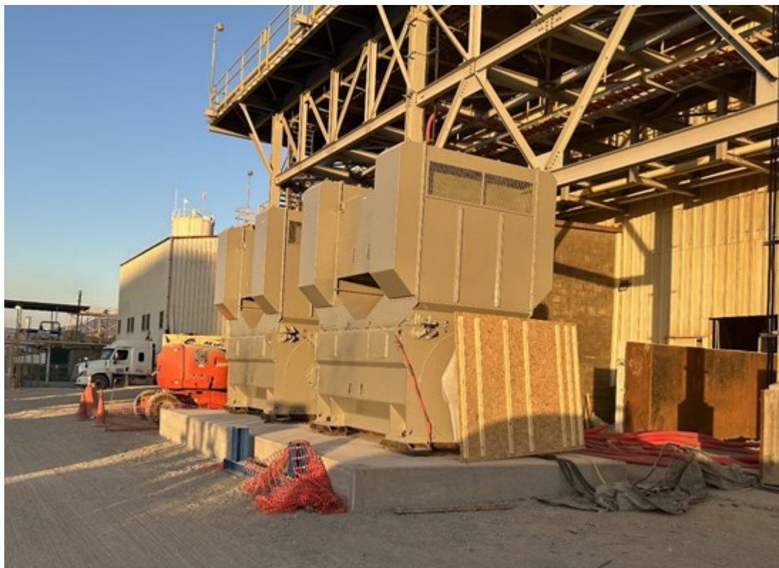
Figure 2: Pre-commissioning of the ball mill's variable frequency drives took place in December in order to mitigate potential risks during the tie-in period in February.

To view an enhanced version of this graphic, please visit: