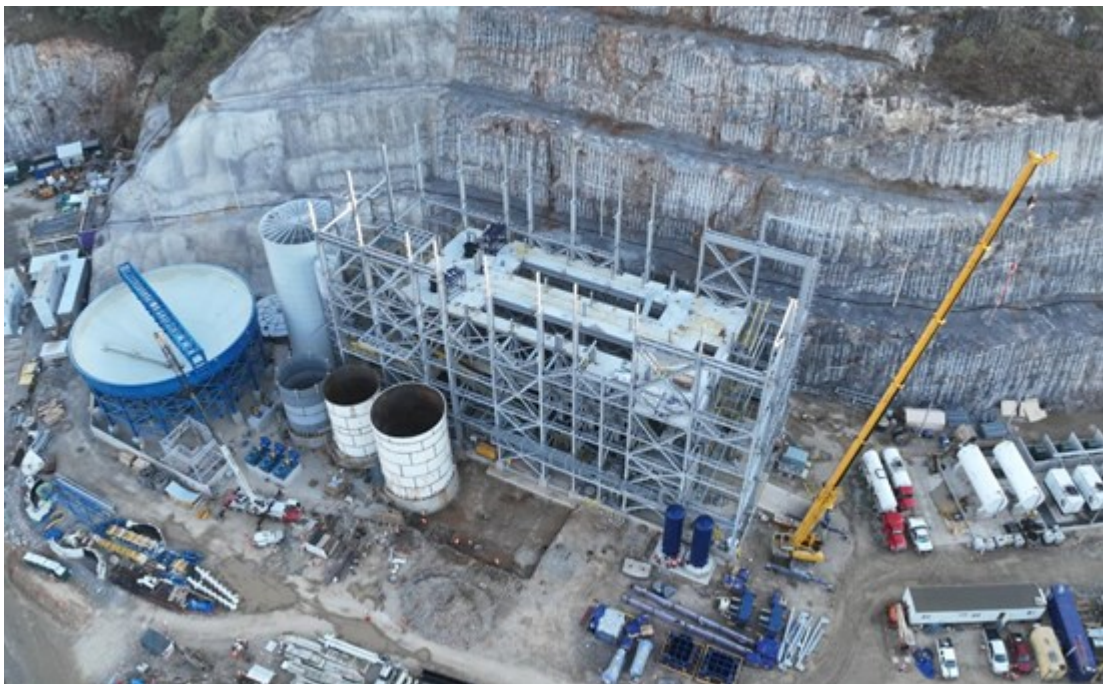
Figure 4: Work progressed on the paste plant during the quarter, including continued erection of the binder silo, thickener, and building steel.

To view an enhanced version of this graphic, please visit: