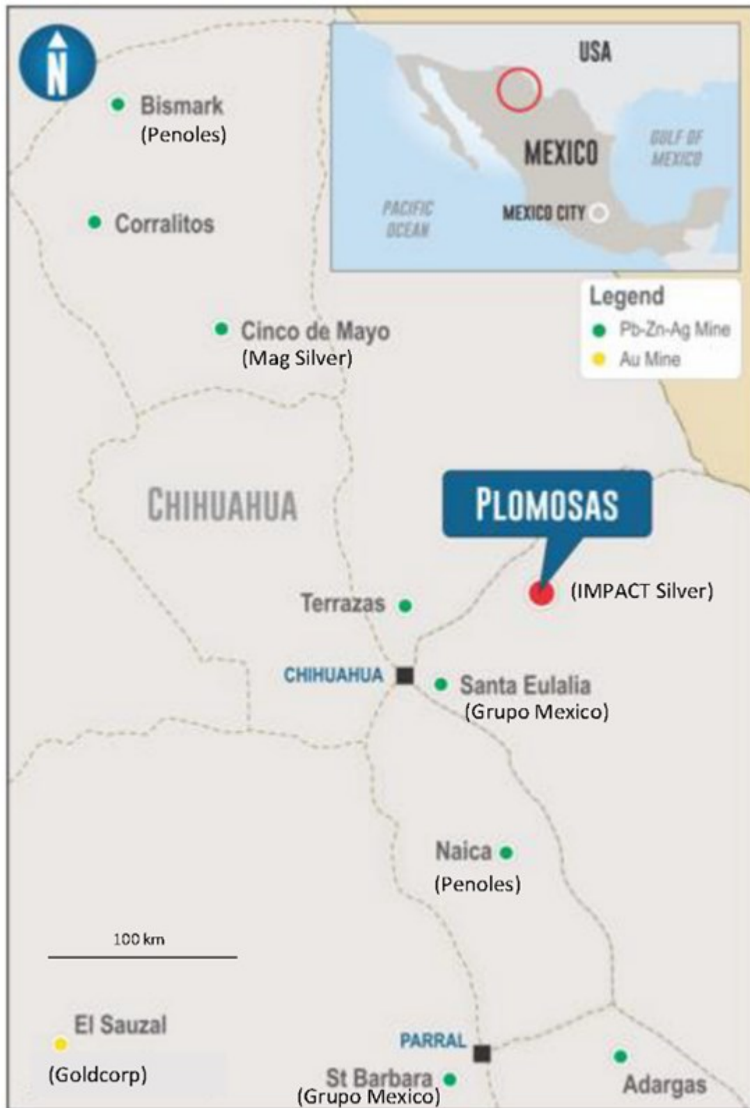
Figure 1: Location map of Plomosas Mine and nearby mines and infrastructure. References to nearby projects are for information purposes only and there are no assurances that Plomosas will achieve similar results.

To view an enhanced version of this graphic, please visit: https://images.newsfilecorp.com/files/4729/237426_f45075dec4d2ca3d_001full.jpg