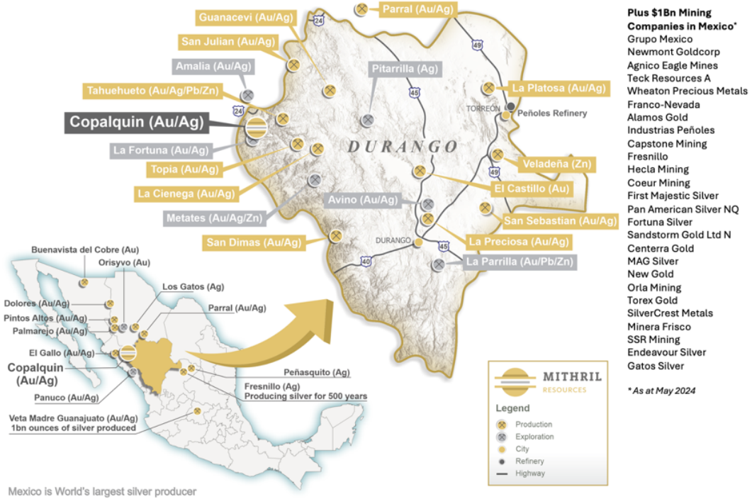
Figure 1 – Copalquin District location map with locations of mining and exploration activity within the state of Durango