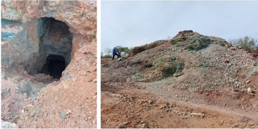
Photo 2 - Access to some of the historic copper mining areas present within the Suaqui Verde Project area

To view an enhanced version of this graphic, please visit: