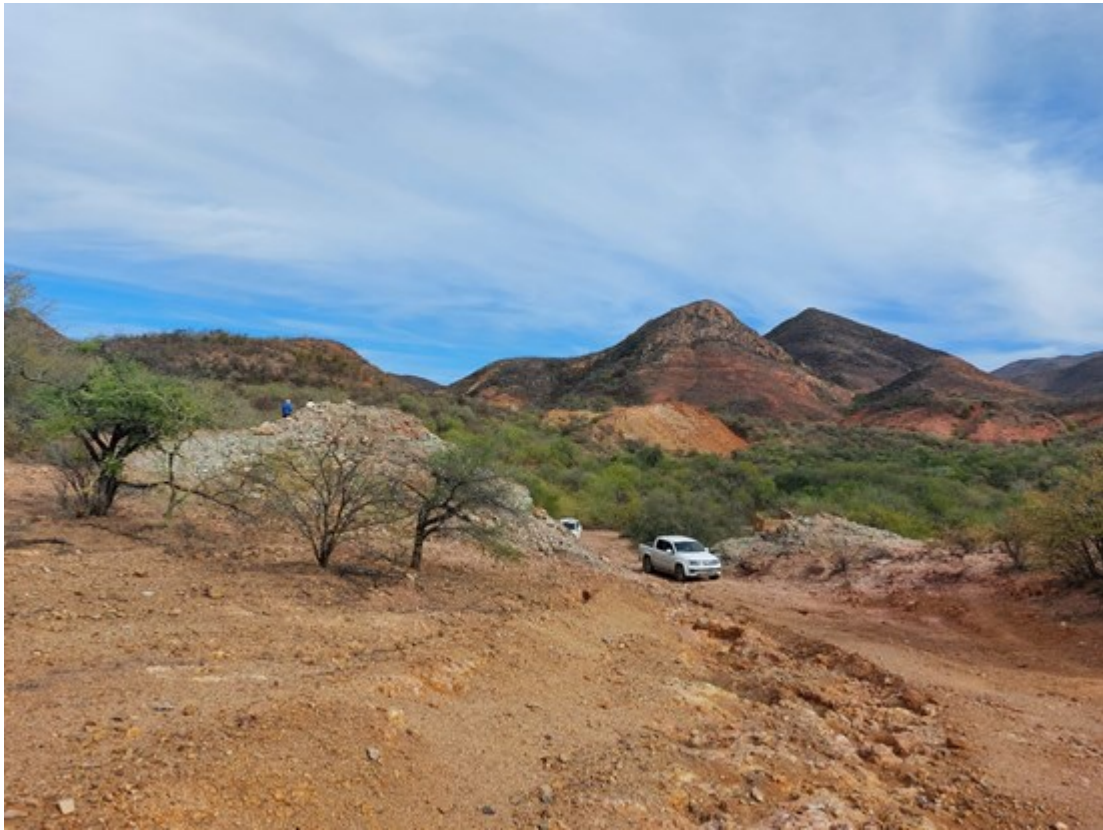
Photo 1 - View of mineralized alteration surrounding Suaqui Verde Project with dumps from old workings in foreground

To view an enhanced version of this graphic, please visit: