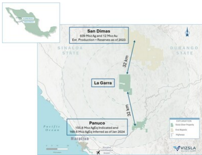
Figure 1: Location map of the La Garra-Metates District, Panuco Project and San Dimas District.