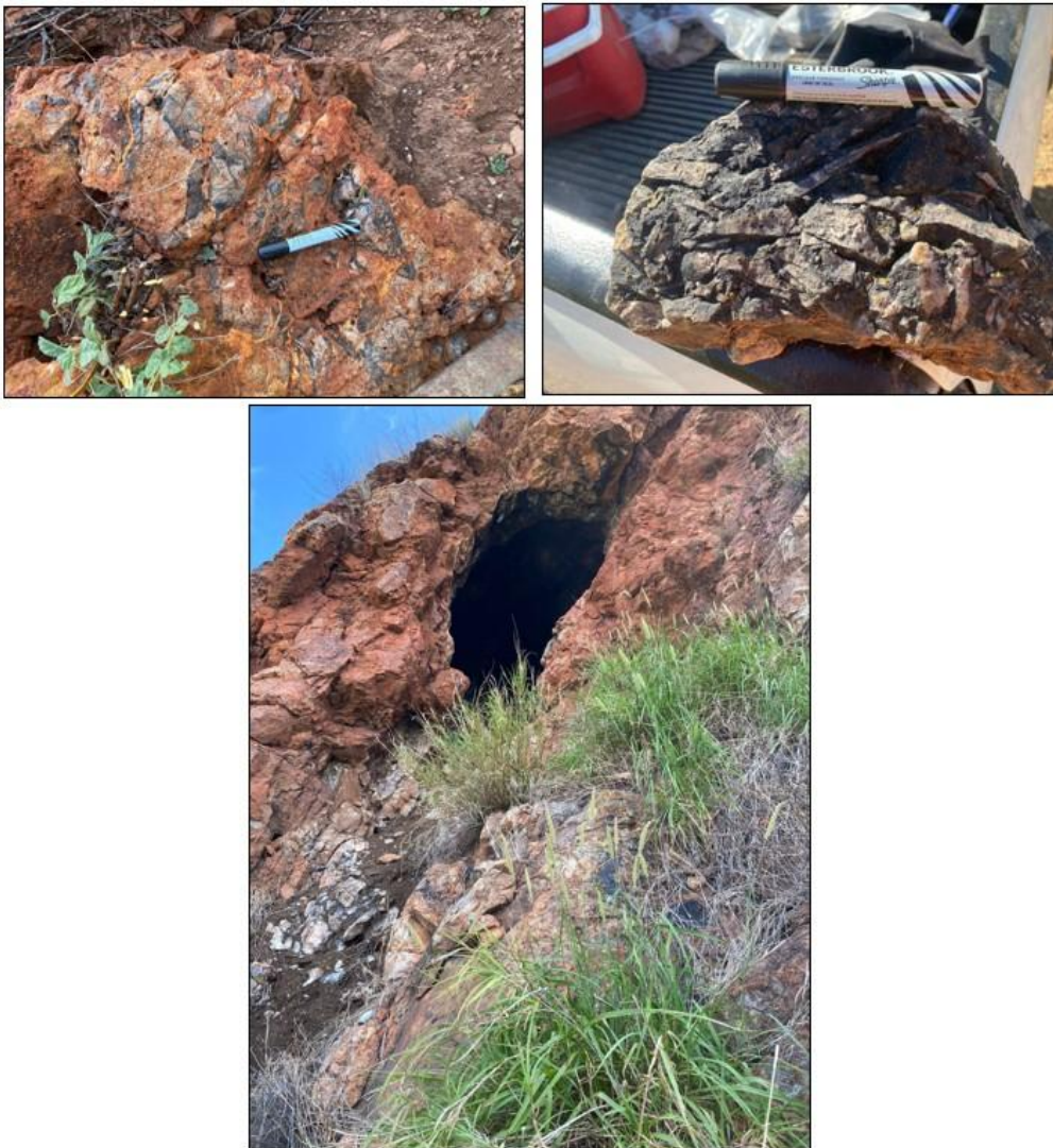
Figure 2. Pilar Expansion area covers over 21 square-kilometers of prospective ground surrounding the established Pilar project. Recent placer activity, historic workings and prospective geology all indicate the area is highly prospective. Preliminary target areas (red dots) and their relative distance to Pilar.