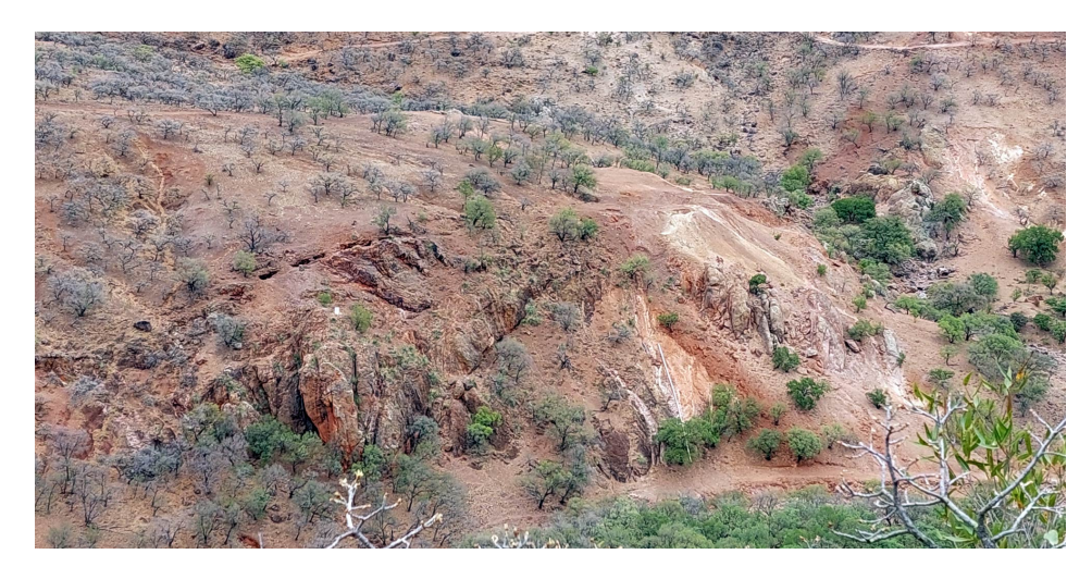
Figure 2: Nora property looking north at the main outcrop of the Candy vein structure.

<u>Project</u>approximately 50 kilometres (km) to the east. Pitarrilla is one of the largest undeveloped silver deposits in the world and was discovered by Perry Durning and Frank (Bud) Hillemeyer, who serve as Silver Dollar's technical advisors.