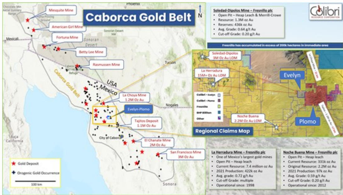
Illustration 2: Location of the Evelyn & Plomo ("EP") properties within Caborca Gold Belt

To view an enhanced version of this graphic, please visit: