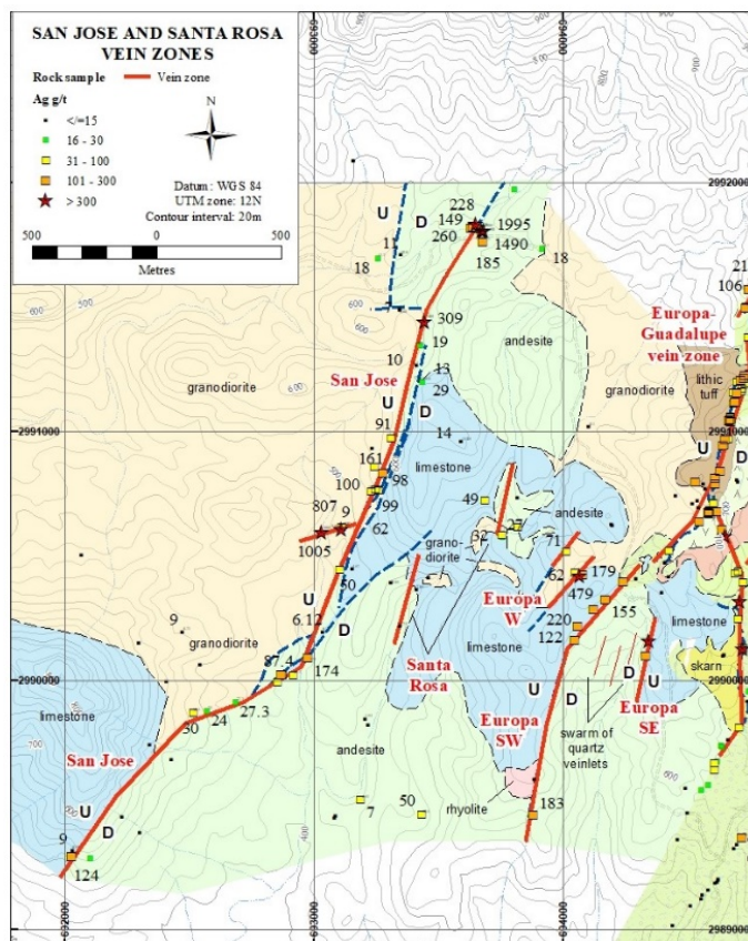
Figure 2. Geological map of the San José, Santa Rosa, and Europa Sur vein zones, Alamos Project. Note U (up) and D (down) symbols indicating relative displacement of fault blocks. Please click on map image to view in full size

Minaurum Gold Inc. (MGG | TSX Venture Exchange; MMRGF | OTC; 78M Frankfurt) is a Mexico-focused explorer concentrating on the high-grade Alamos Silver project in southern Sonora State. With a property portfolio encompassing multiple additional district-scale projects, Minaurum is managed by one of the strongest technical and finance teams in Mexico. Minaurum's goal is to continue its founders' legacy of creating shareholder value by making district-scale mineral discoveries and executing accretive mining transactions. For more information, please visit our website at www.minaurum.com and our YouTube Minaurum Video Channel .